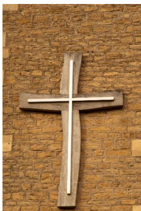
Photo of St Laurence School Cross

A good Easter resonates with life renewed by God's grace. Through the love of the risen Christ, we are transfigured—healed and restored—as a 'community of the resurrection.'