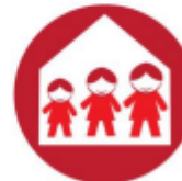
Winsley Primary School